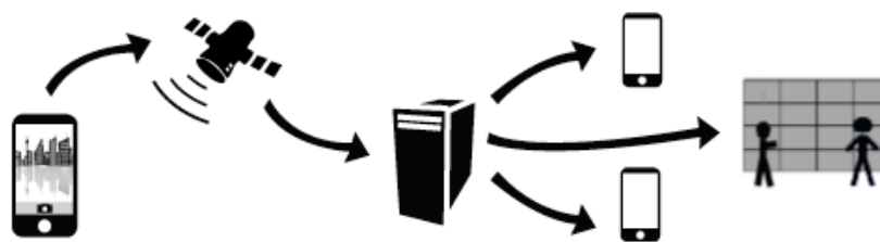
Figure 2. HLD information flow: Captured images from the HLD are geotagged and sent via wi-fi to the smartroom server where they are saved on the server and loaded onto the SmartWall; other students’ receive HLD updates.

Working closely with a math teacher, we have co-designed a “knowledge community” approach in which a grade 12 class is responsible for the development of student-created artifacts that are accessible by the entire class through an online portal. Students access the portal through a website that uses an application programming interface (API) for